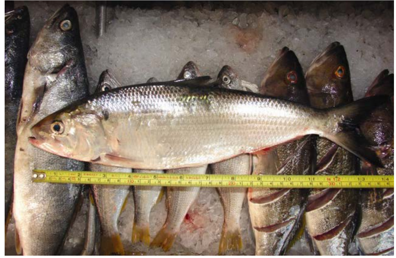
Figure 2. Individual of American shad, Alosa sapidissima, captured on June 28, 2012, at Bahía de Todos Santos, Baja California, México.

2011 (< -0.5^{\circ} C), with the lowest temperature anomaly at December ( -1.5^{\circ} C), and weakened in April 2012 to -0.5^{\circ} C (NOAA 2013).