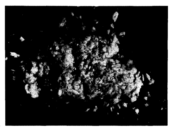
FIGURE 2. Contents of "gorged" stomach shown above, consisting almost entirely of fragmented euphausiids. All five specimens of squid were of the same body length within a few mm.

The identification of food items found in the squid's stomach contents presents a difficult task even for the experienced microscopist, because this animal does not swallow its prey intact, as do most of the fishes. Instead, it thoroughly dismembers it; heads are removed, appendages are almost never found intact. What the investigator finds under the